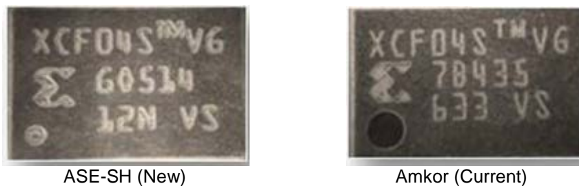
Figure 1: Top Mark Detail

Country of origin will be changed from PHL to CHINA under package bottom by molding ejector pin (refer to Figure 2 ), and pin# 1 indicator change from molding ejector to laser mark (refer to Figure 1 ) on package in new assembly ASE-SH. The Top marking and Country of Origin detail for method of Identification is in Table 2 .